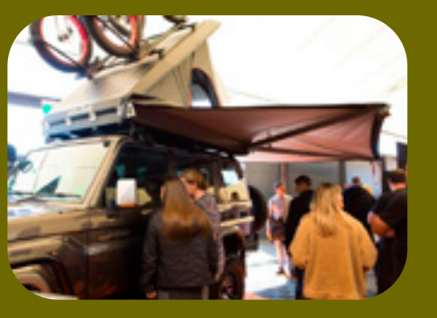
15 - 17 March 2024 National 4x4 Outdoors Show